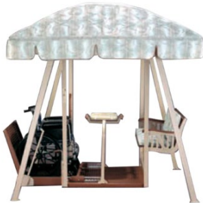
WhisperGLIDE Wheelchair Accessible

This year Trinity will be raising funds for a WhisperGLIDE Wheelchair Accessible swing to be placed in the Care Center Cottages indoor park area.